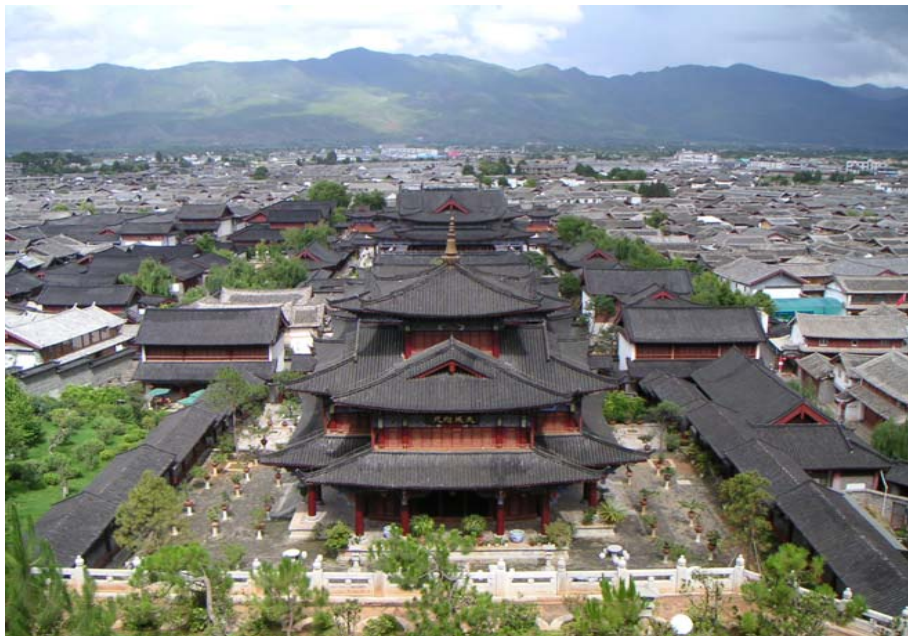
The Earthly Paradise—Lijiang Ancient Town

August 7-11, 2011 Lijiang, Yunnan, China