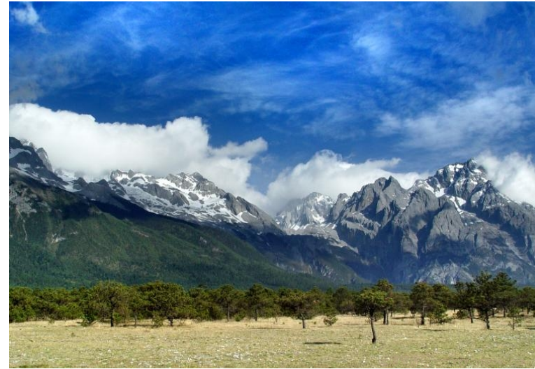
Jade Dragon Snow Mountain

The post-symposium tour covers the two-day sightseeing around Lijiang town, Jade Dragon Snow Mountain and Shangri-La