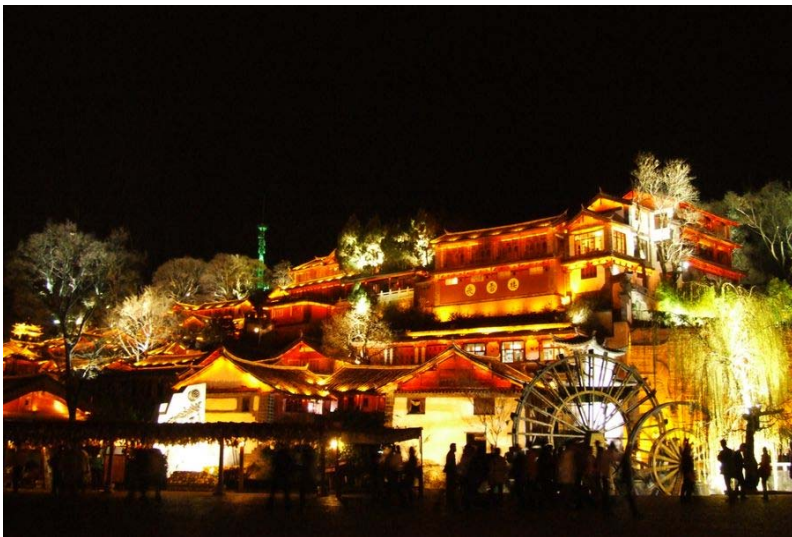
The night view of Lijiang town

All these natural sceneries and these cultural treasures of the minority peoples have been continuously drawing tourists from all over the world and have recently vote Lijiang as one of the favorite destinations in China